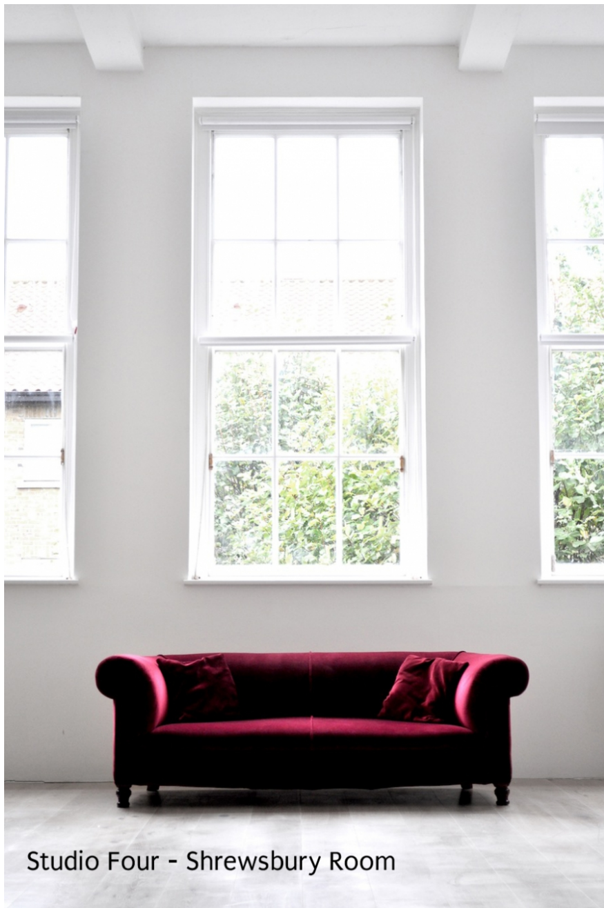
Studio Four - Shrewsbury Room