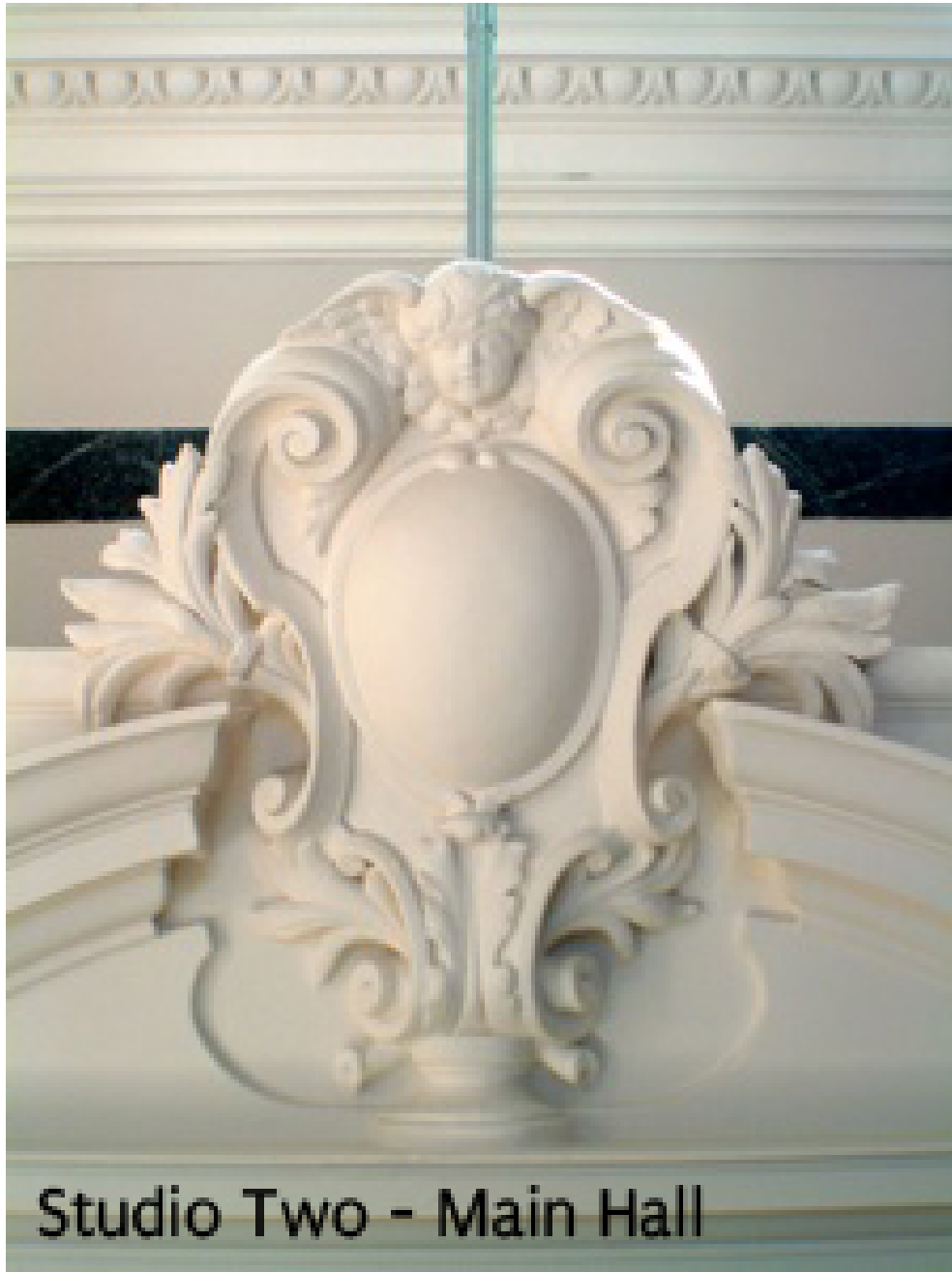
Studio Two - Main Hall