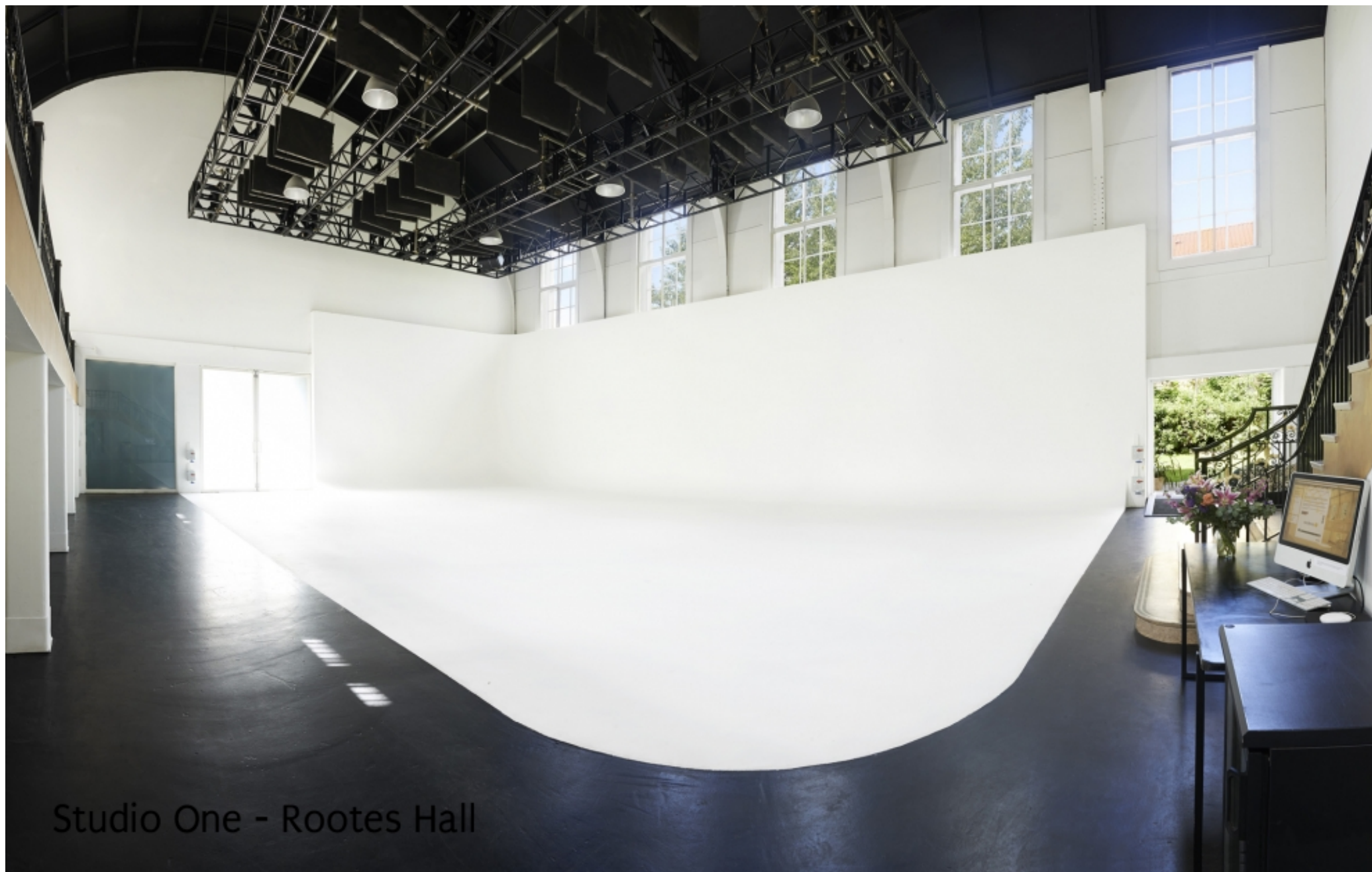
Studio One - Rootes Hall