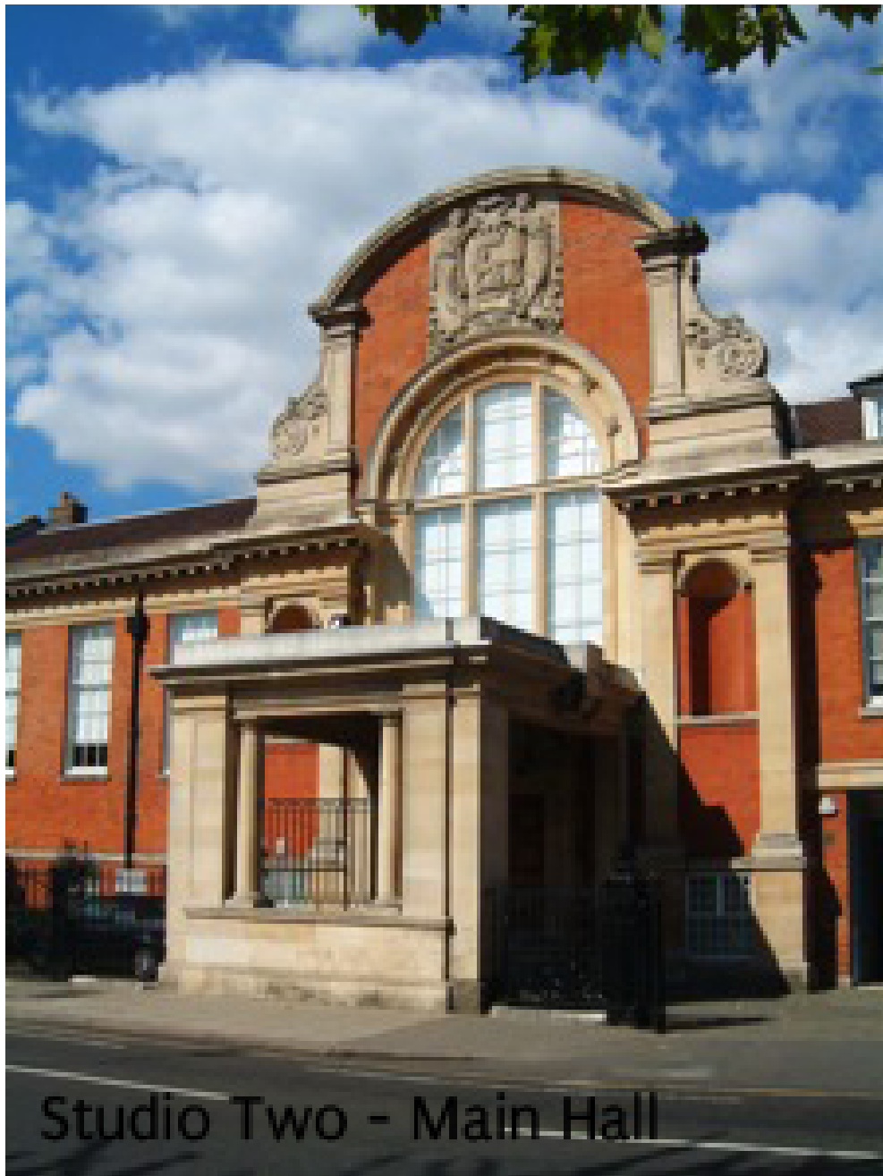
Studio Two - Main Hall