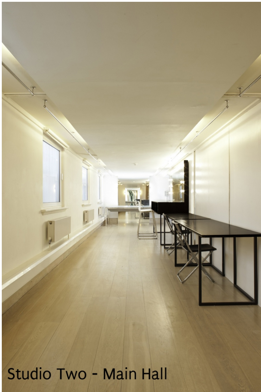
Studio Two - Main Hall