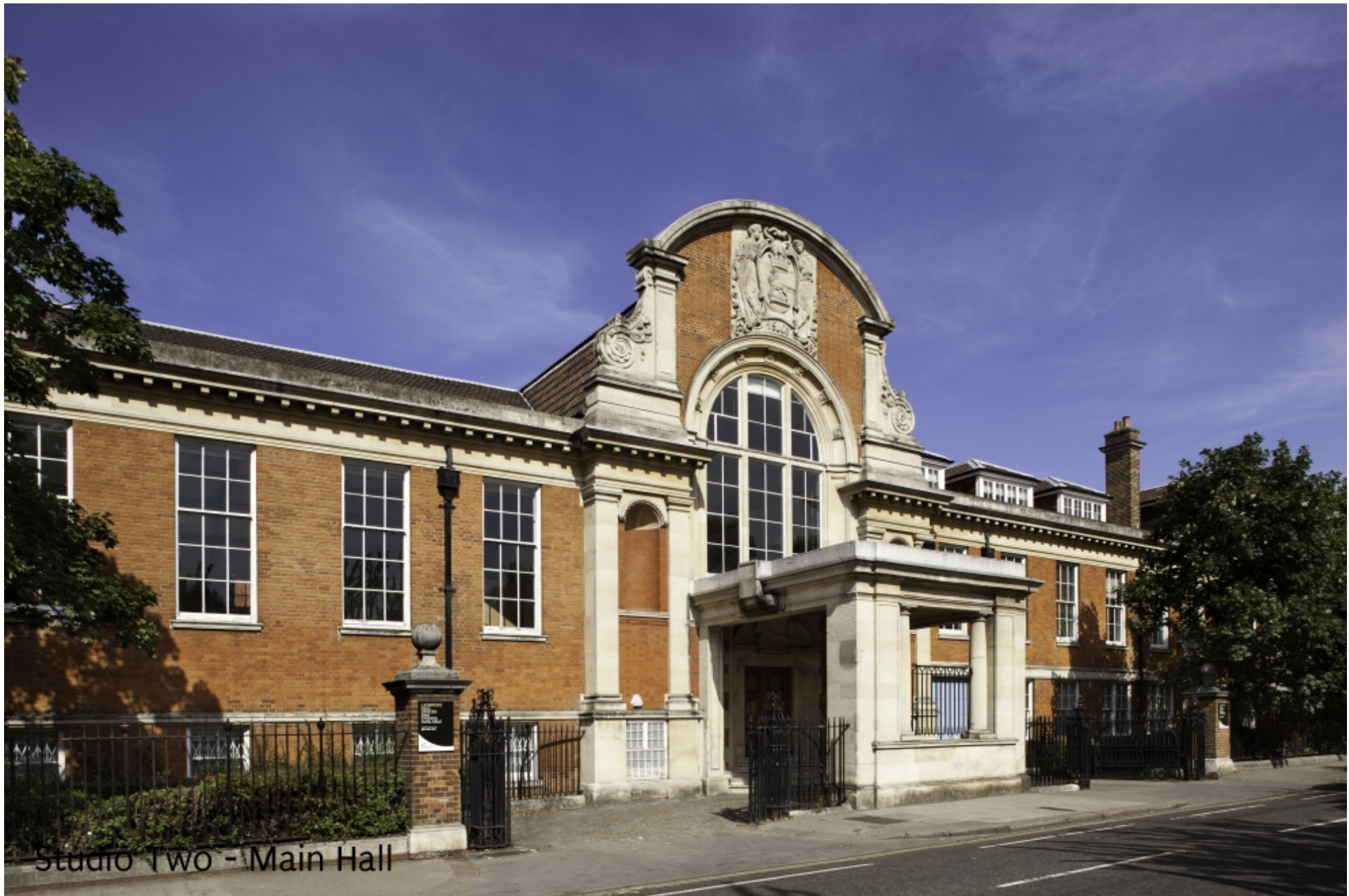
Studio Two - Main Hall