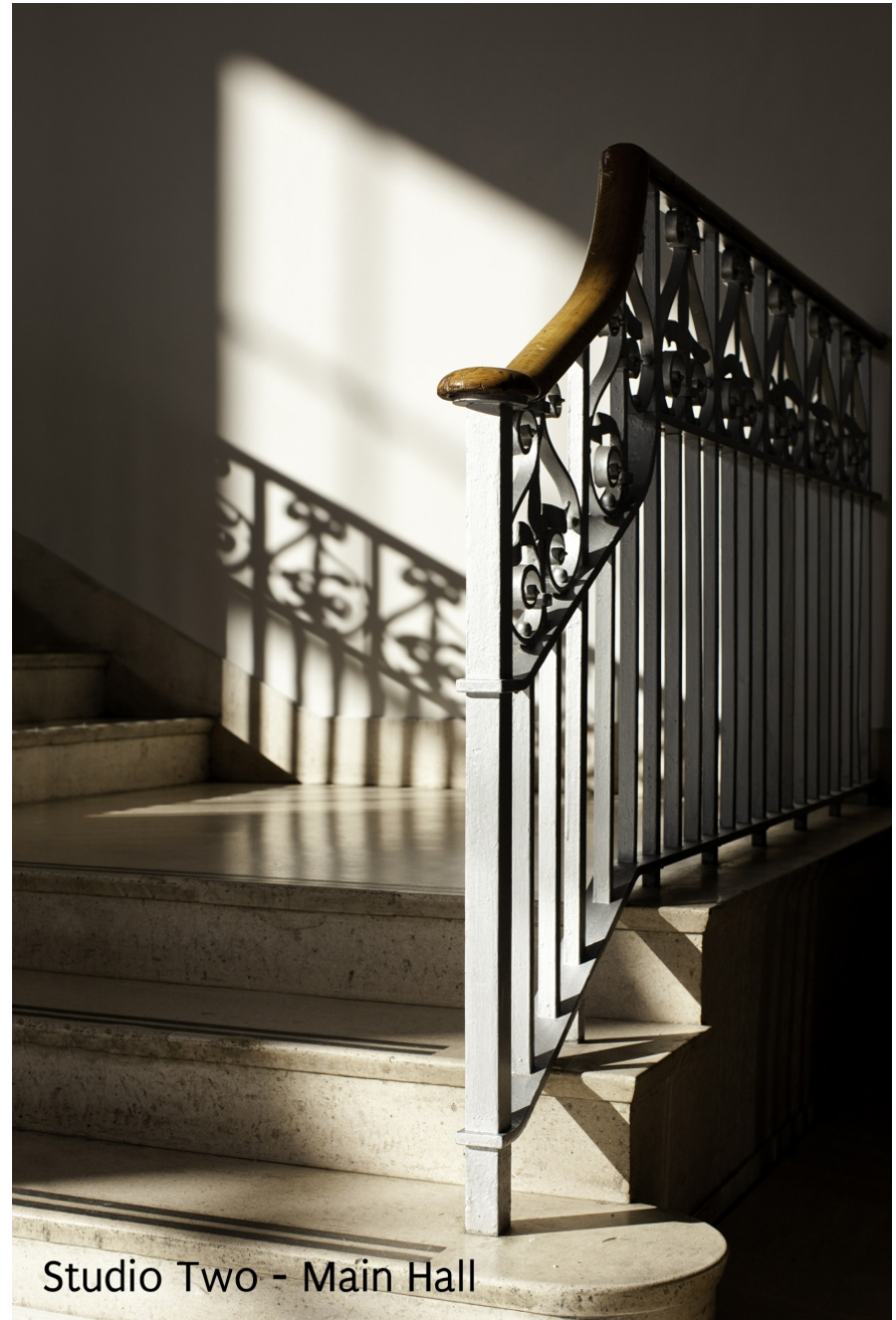
Studio Two - Main Hall