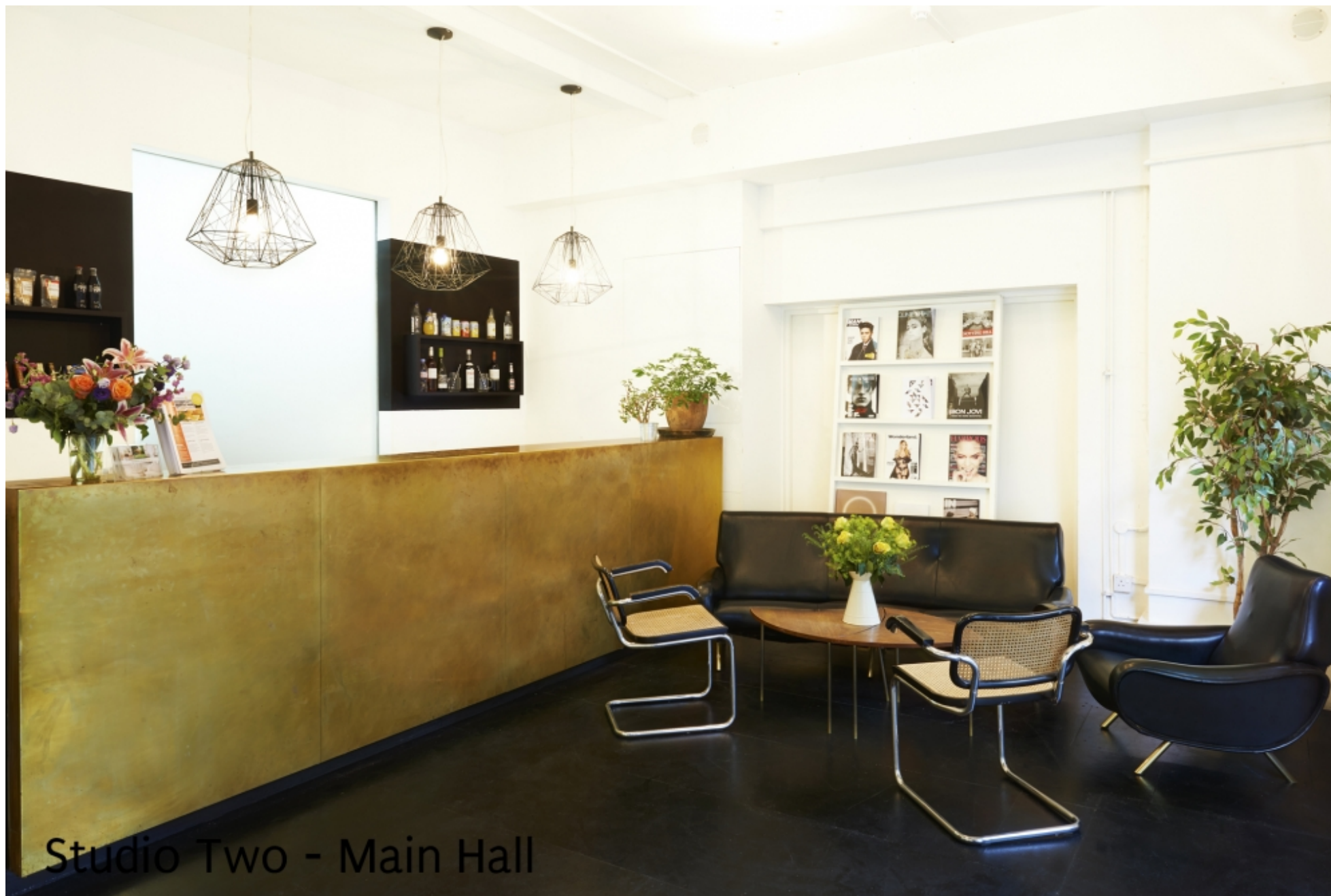
Studio Two - Main Hall