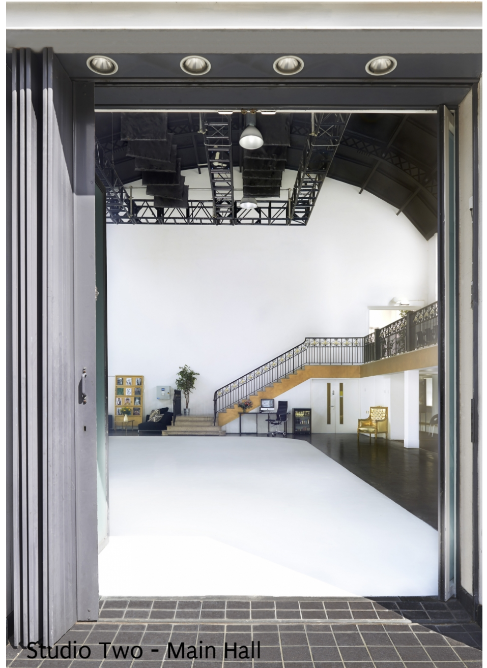
Studio Two - Main Hall