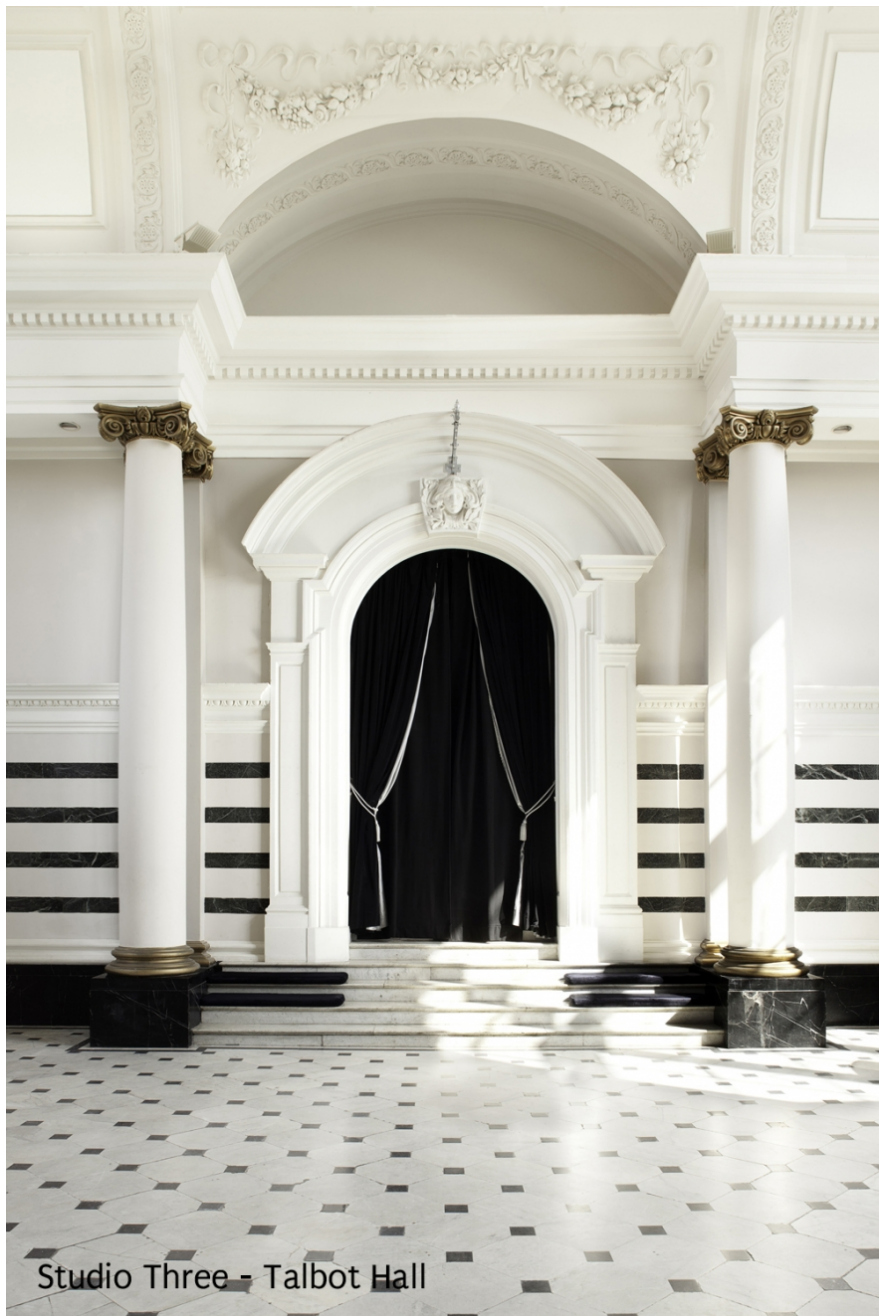
Studio Three - Talbot Hall