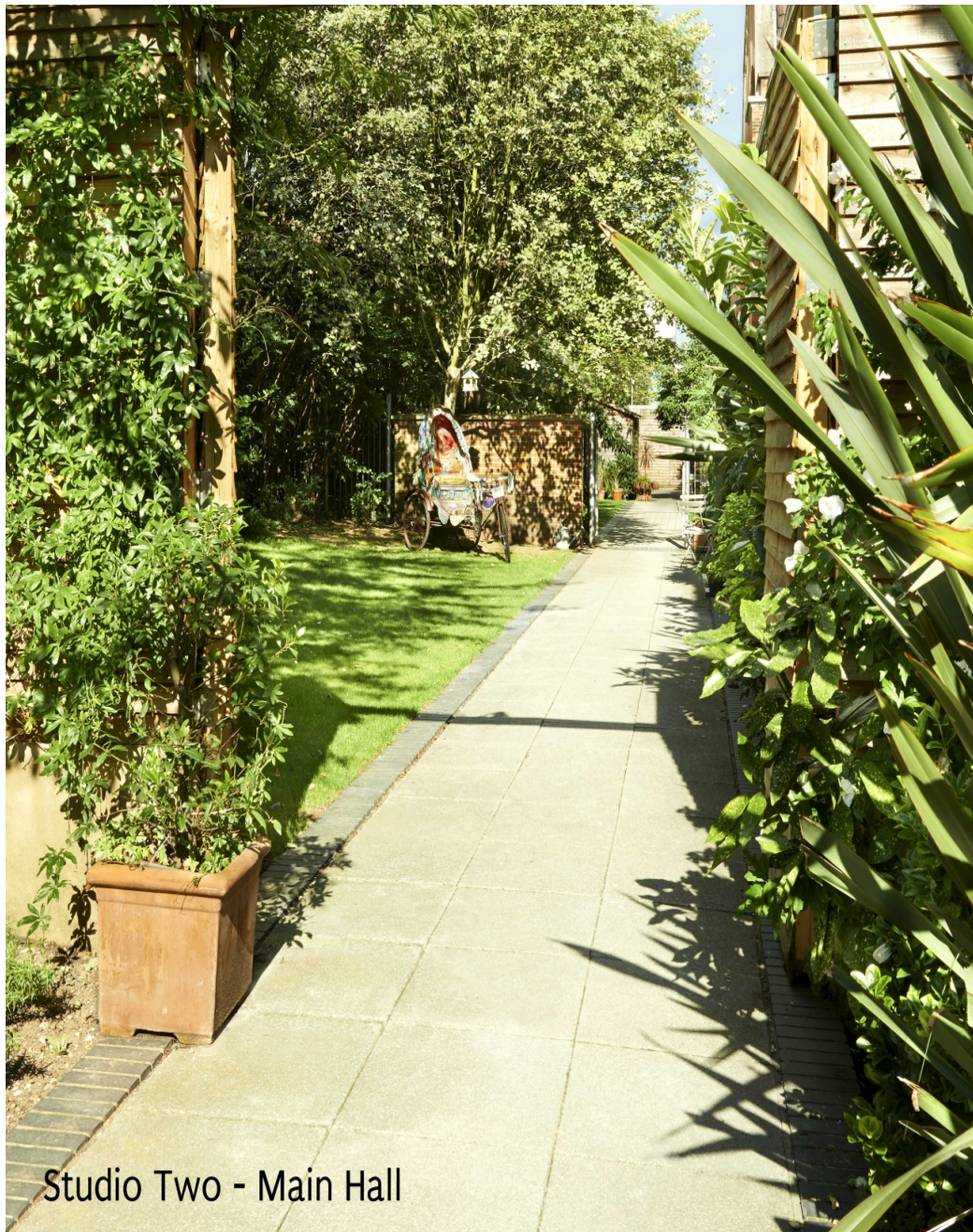
Studio Two - Main Hall