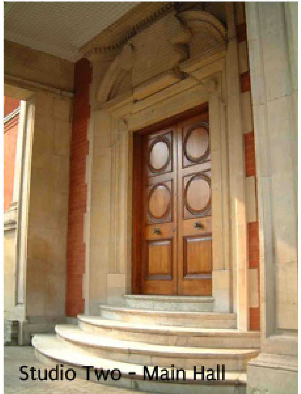
Studio Two - Main Hall