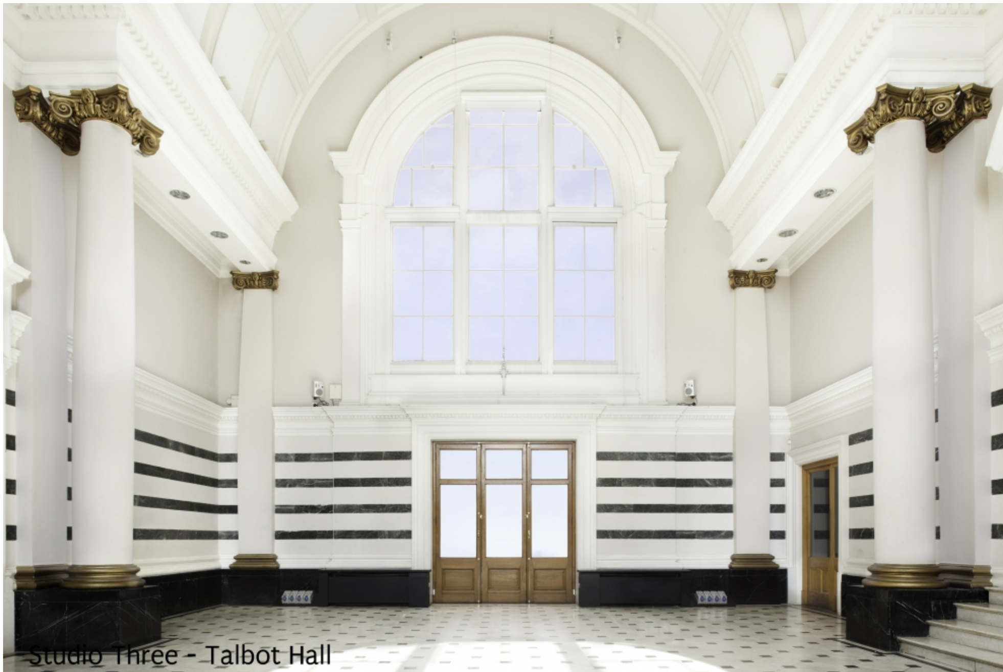
Studio Three - Talbot Hall