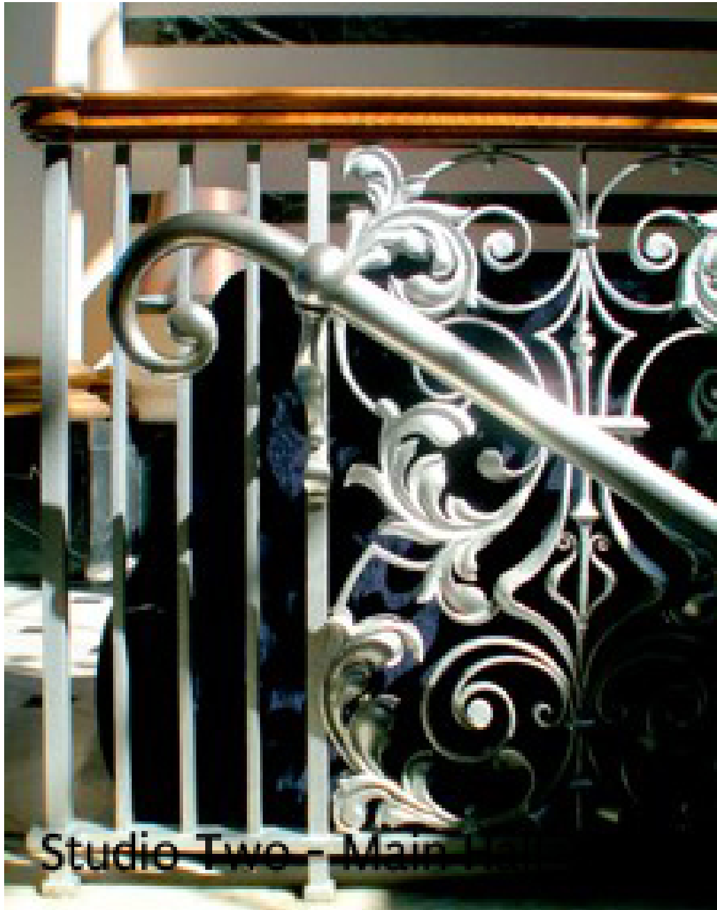
Studio Two - Main Hall