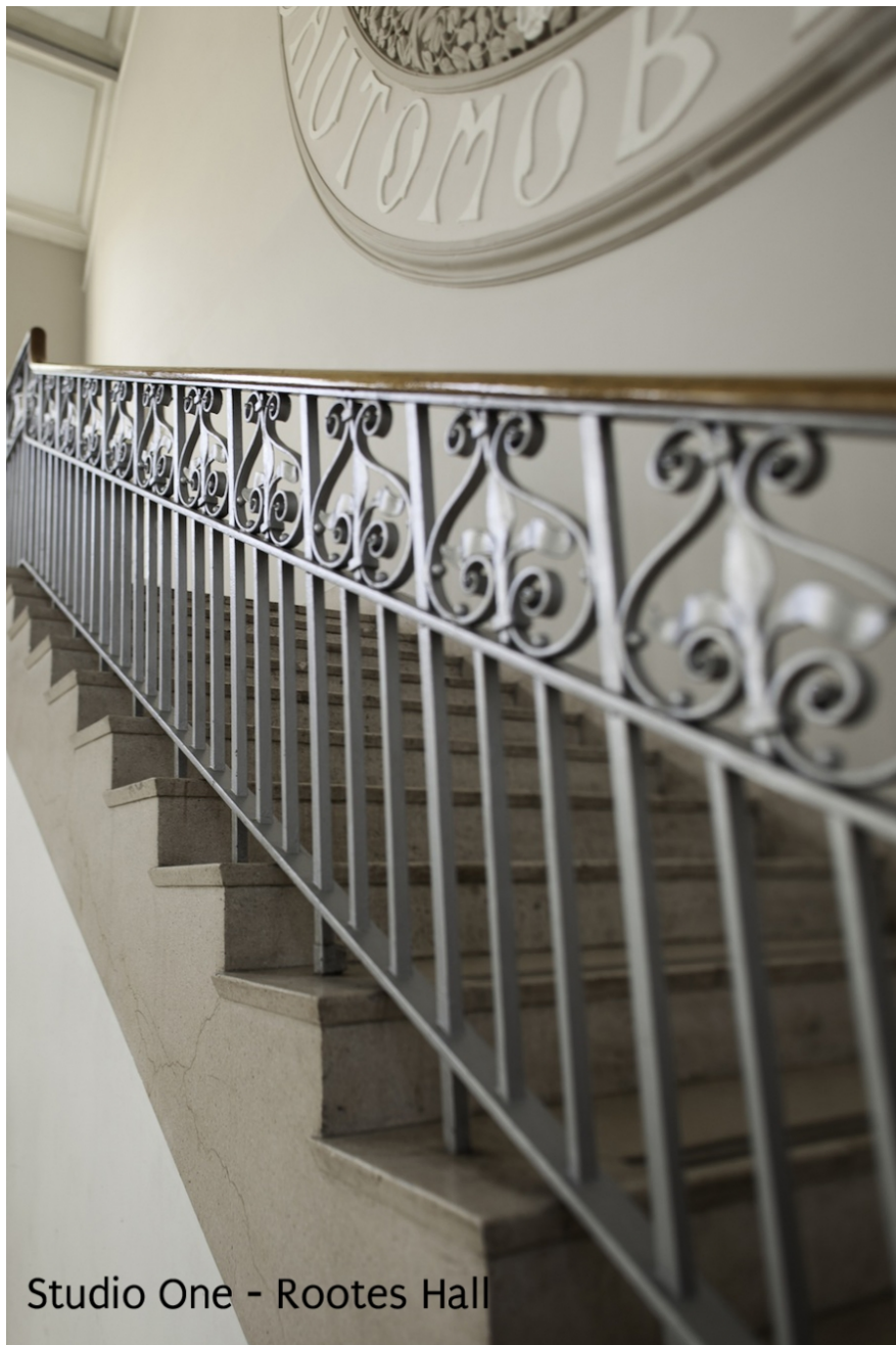
Studio One - Rootes Hall