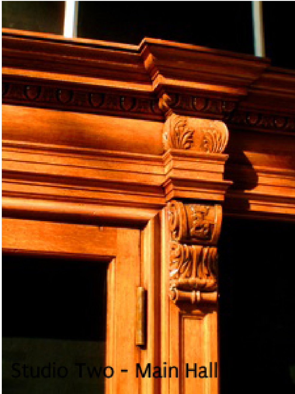
Studio Two - Main Hall