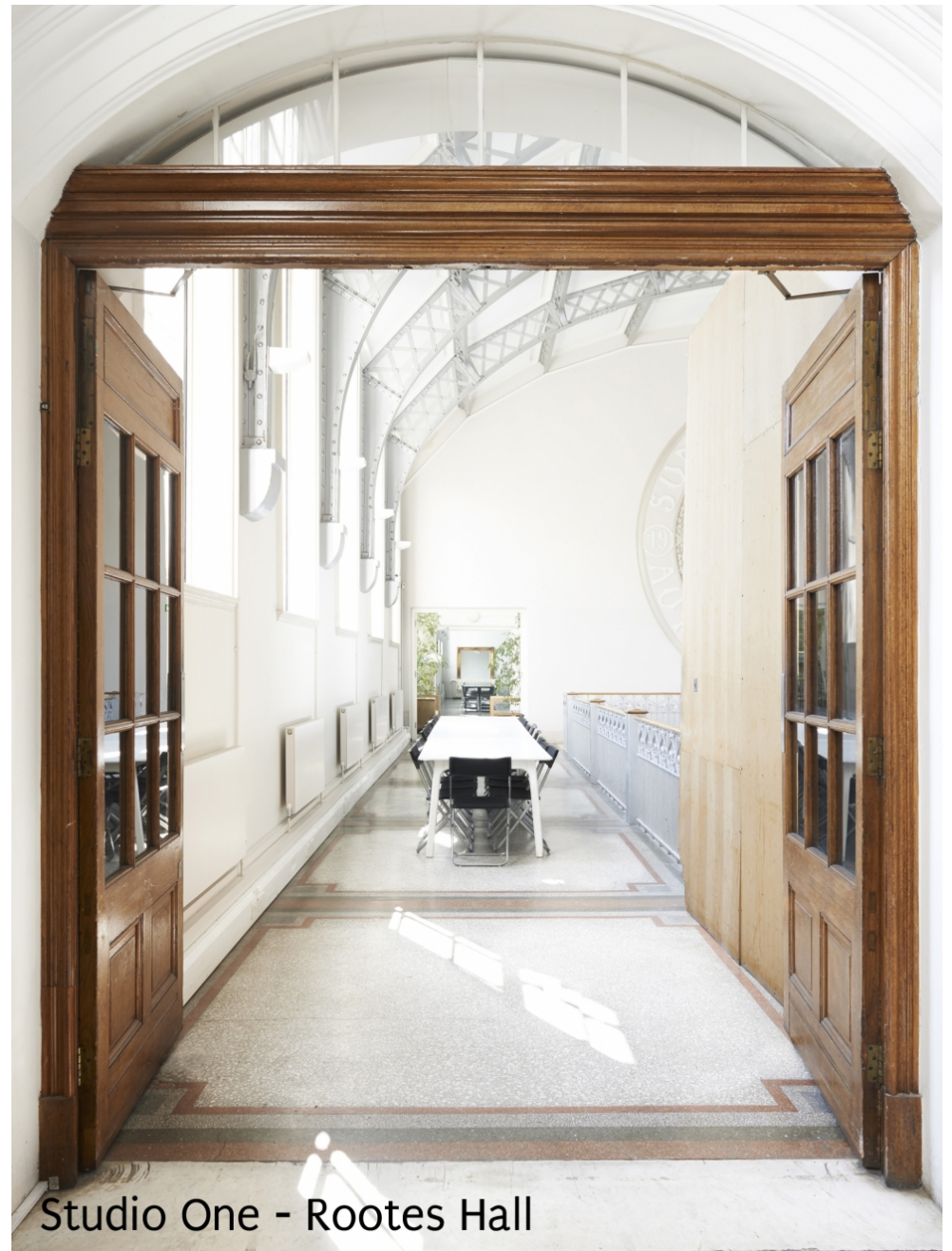
Studio One - Rootes Hall