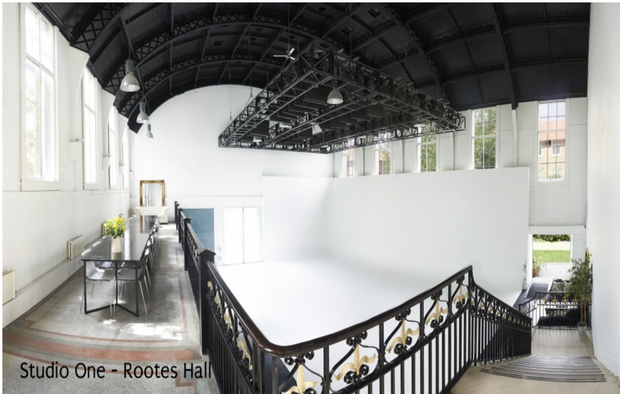
Studio One - Rootes Hall