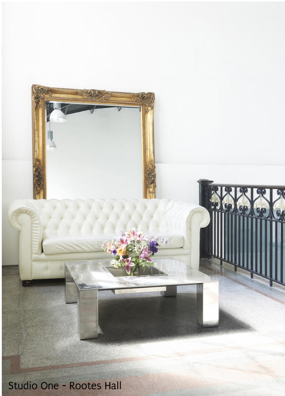
Studio One - Rootes Hall