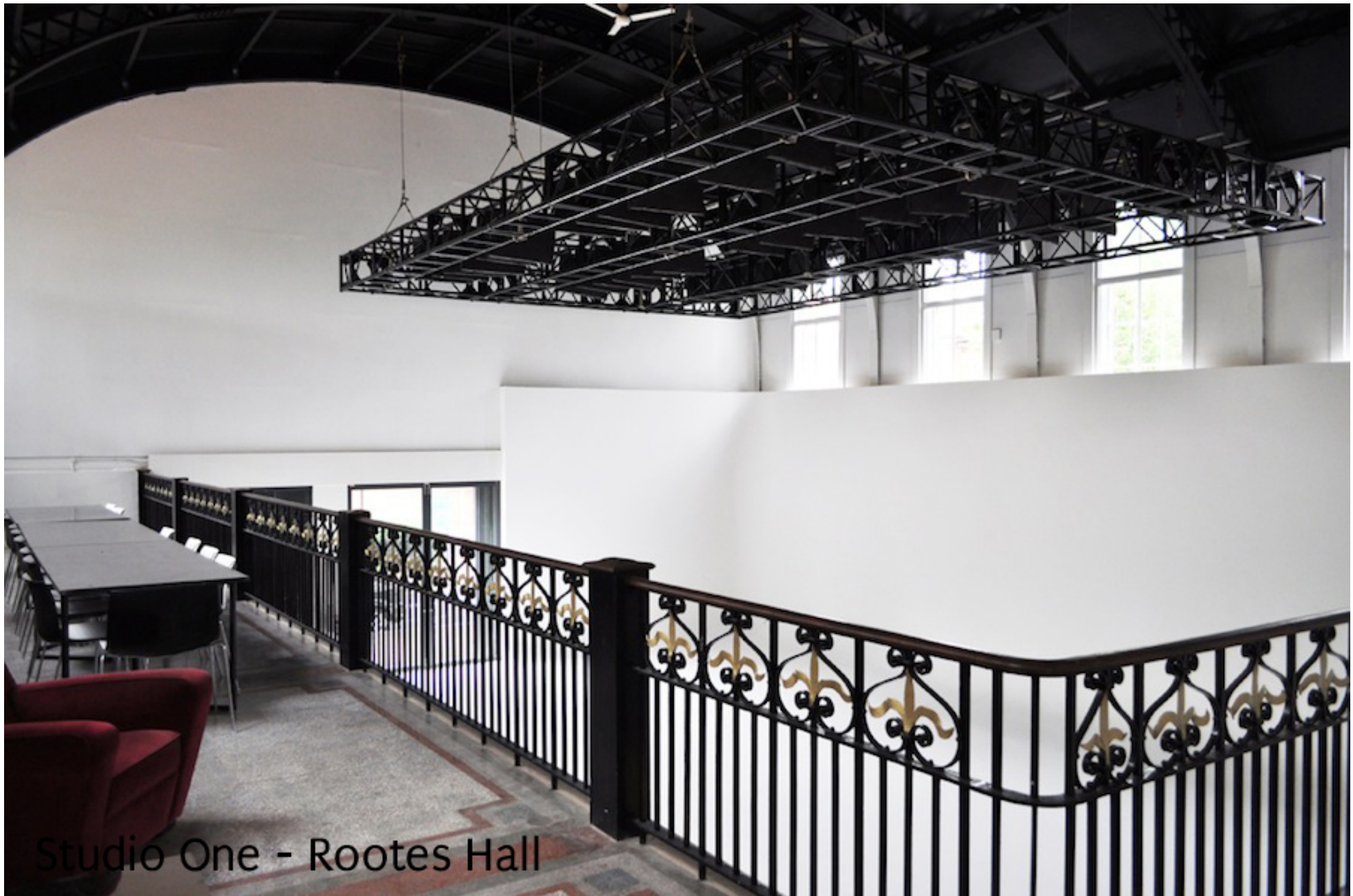
Studio One - Rootes Hall