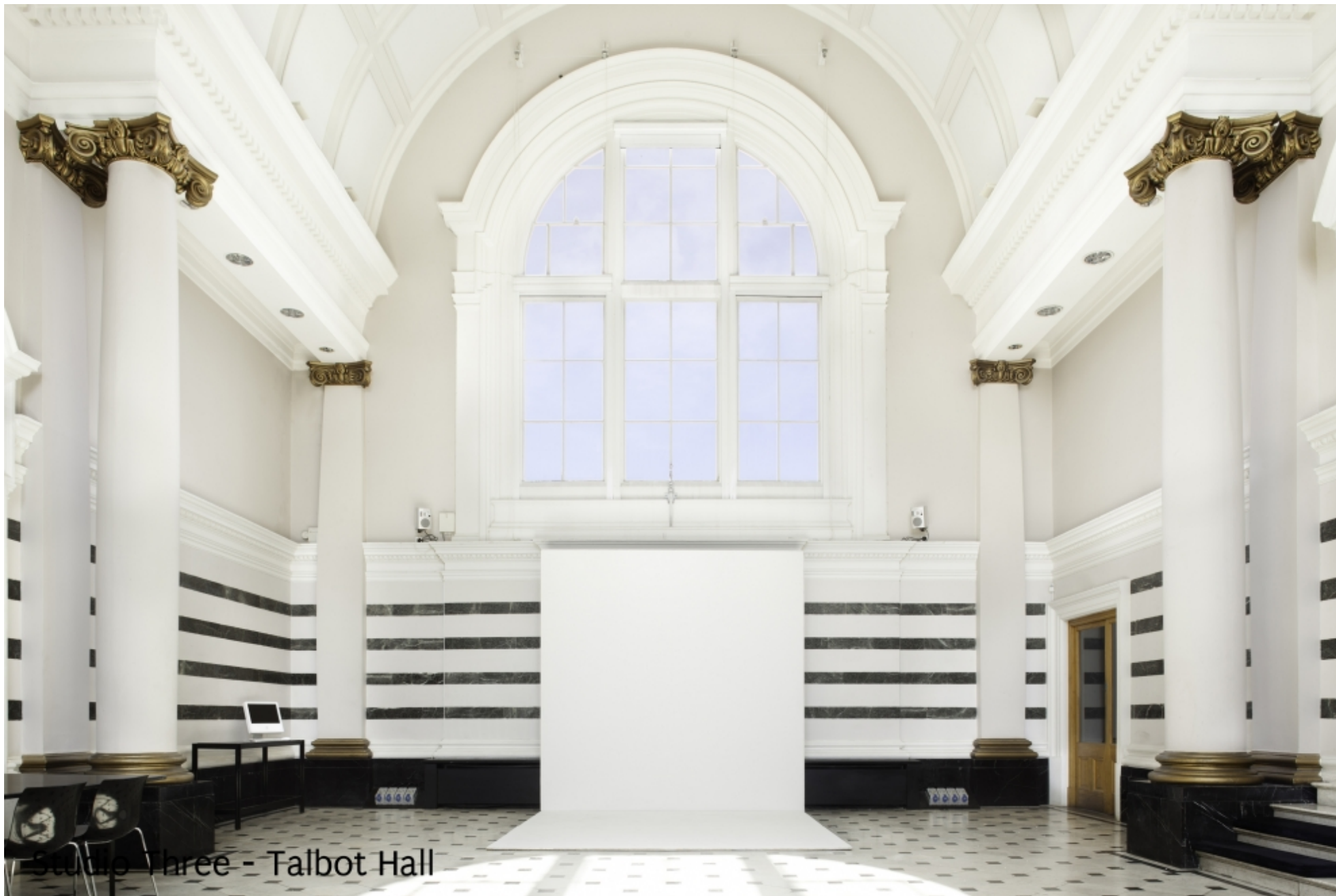
Studio Three - Talbot Hall