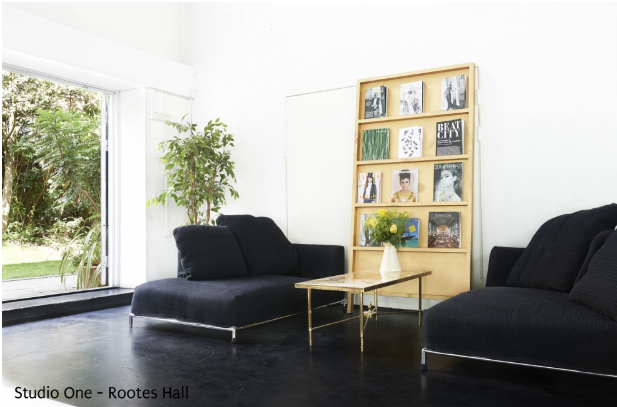
Studio One - Rootes Hall