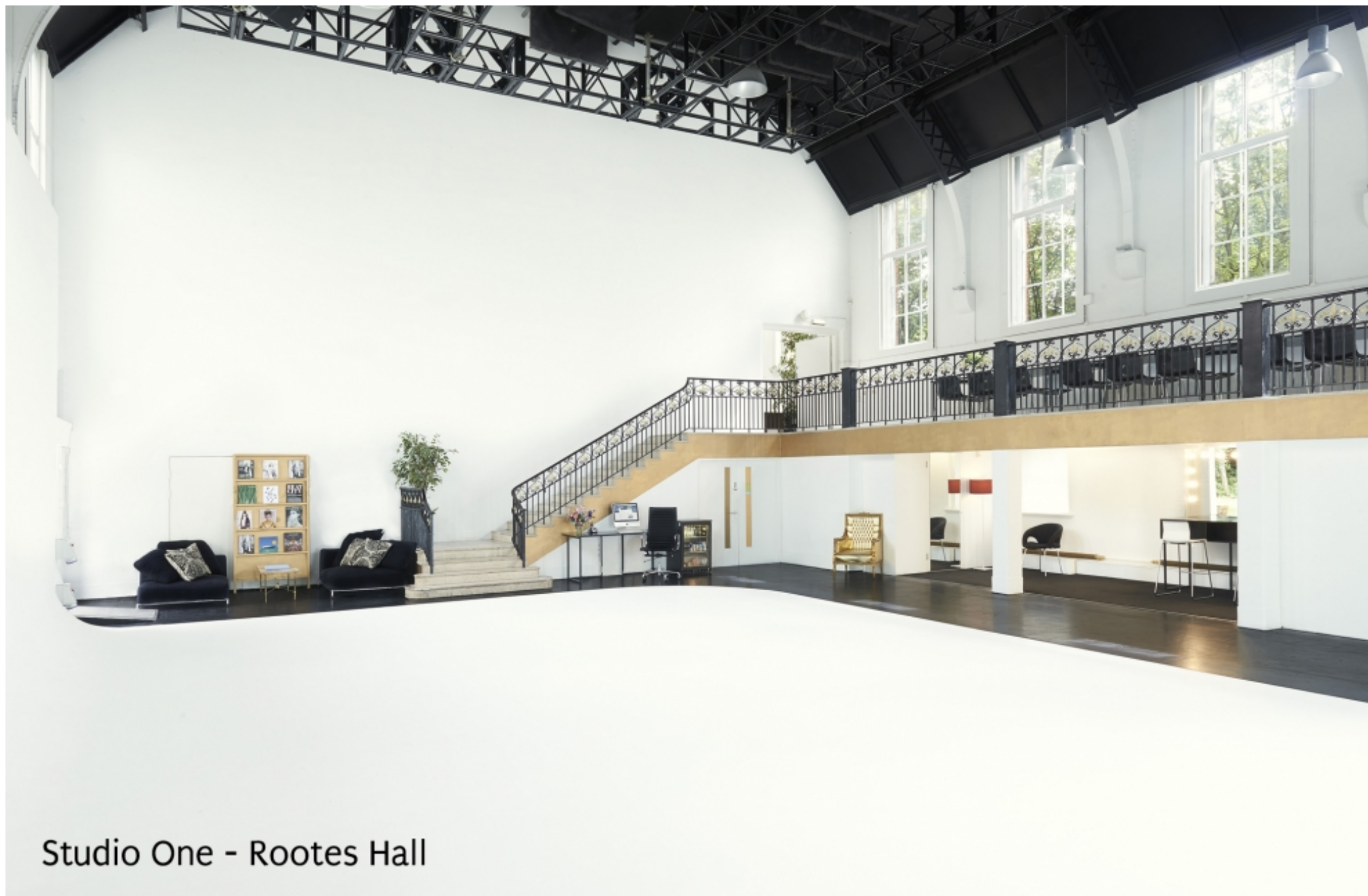
Studio One - Rootes Hall