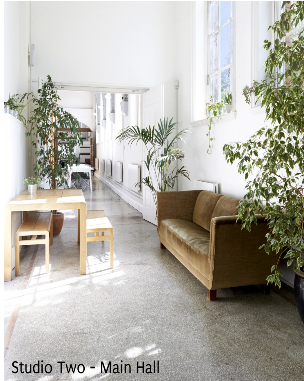
Studio Two - Main Hall