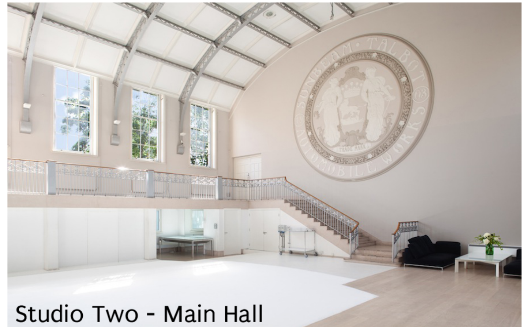
Studio Two - Main Hall

This beautiful daylight studio complex is a unique blend of Edwardian elegance and modern aesthetic. Its three large halls and meeting room connect via a mezzanine for lounging, dining or shooting, and grand marble terrazzo staircases. Large changing rooms and three comfortable sofa areas, all studios containing minibar for client comfort. Drive in access. Studio 1 = 3,200 sq.ft Wrap-around j-cove 44 (width) x 15 (height) feet Lighting truss** at 20ft high (box truss 33ft x 24ft). Daylight to full black-out, large North and South facing windows. Marble terrazzo staircase and mezzanine for dining, lounging or to shoot from. Access to large garden. Large changing rooms for hair and make up / sofa areas for client comfort with backwash facilities. Connects with Studios 2 and 4 for larger productions. Studio 2 = 3,000 sq.ft 24 feet width x 22 feet height Vaulted ceiling, height to apex 31 feet Garden Access Additional side room for production, changing or retouching Studio 3 = 1,500 sq.ft 10 x 10 ft white room featuring both north and south facing windows with vaulted ceiling Studio 4 = 600 sq.ft North and South facing windows with black out blinds and classic