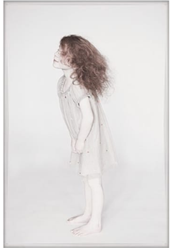
Bijeweled tulle dress, by Borpoint.