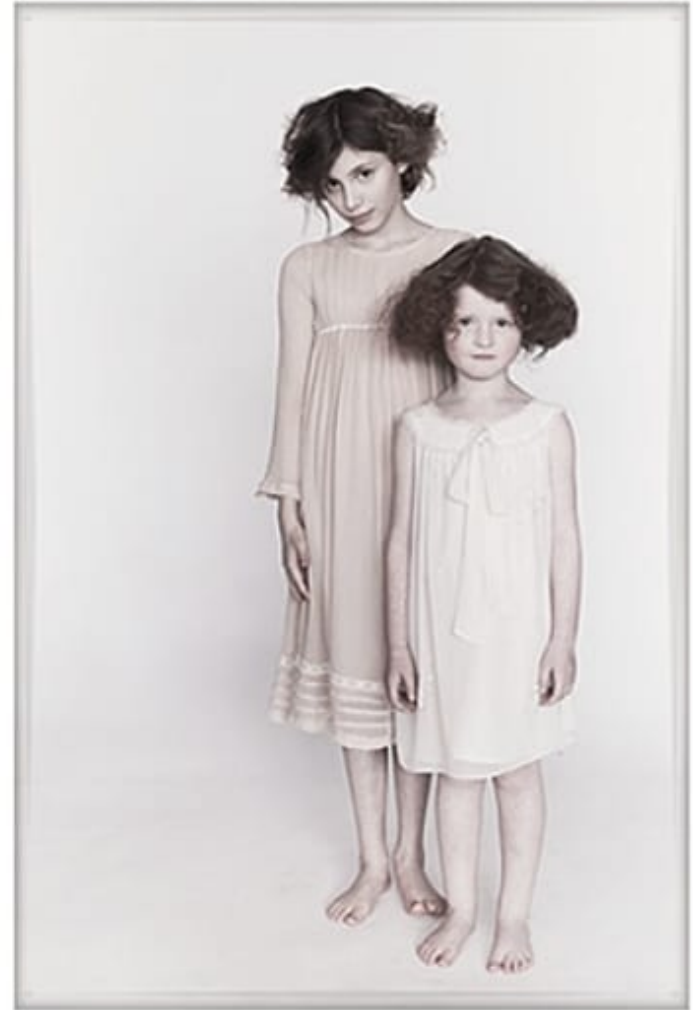
LEFT / Peach forget-me-not chiffon dress, by lovegorgeous. RIGHT / Flesh coloured tie neck and raw edge dress, by Bonpoint.