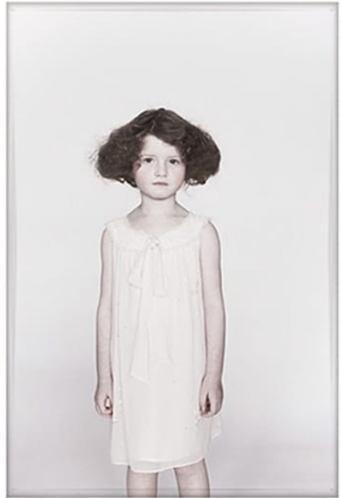
Pale grey empire line silk dress, by Marie Chantal.