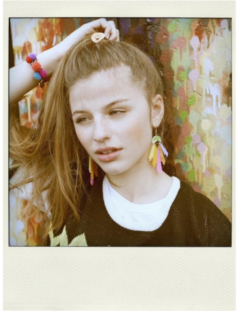
Nina Beckett Hair Kids

CAROLHAYES MANAGEMENT CREATIVE ARTIST & STYLE MANAGEMENT