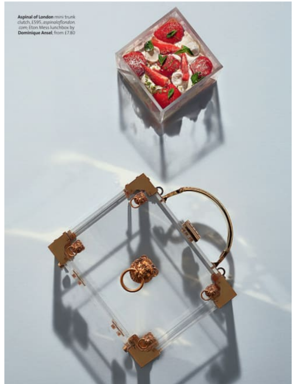
Aspinal of London mini trunk clutch, £595, aspinaloflondon.com ; Eton Mess lunchbox by Dominique Ansel, from £7.80