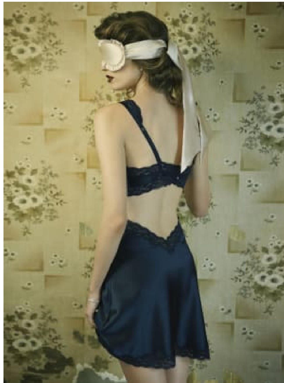
Joy Wilson Stylists | Womens Fashion

CAROLHAYES MANAGEMENT CREATIVE ARTIST & STYLE MANAGEMENT