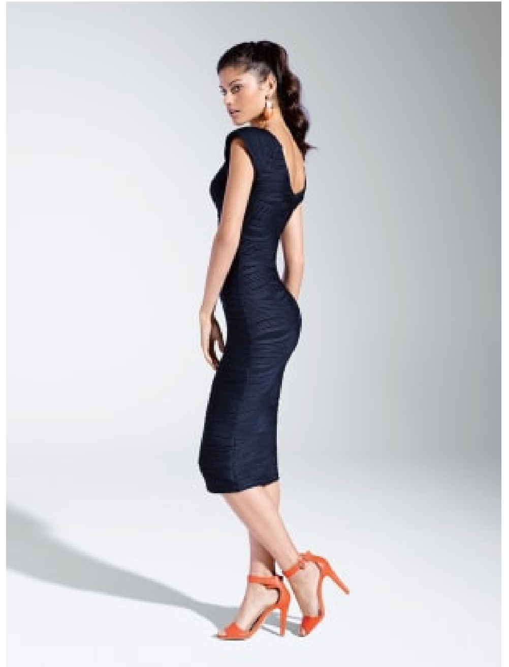
Joy Wilson Stylists | Womens Fashion

CAROL HAYES MANAGEMENT CREATIVE ARTIST & STYLE MANAGEMENT