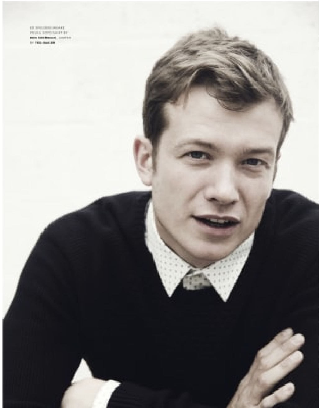
ED SPELERS MAKE PEOPLE SAY 'WHAT IF' AND 'HOW CAN I', LATER BY TOM SPRATT