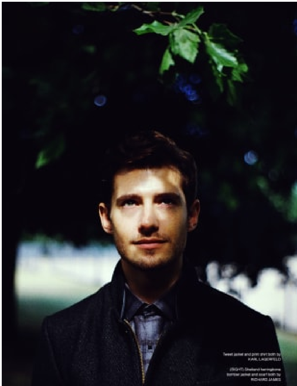
Tweed jacket and shirt shirt both by PAUL LAGUERRELO